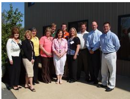
School representatives met last March to form the Blue Ridge Christian Conference.

Along with a number of other schools in the area, Hendersonville Christian School formed the Blue Ridge Christian Conference this past spring. Founding schools besides HCS include Blue Ridge Christian Academy, Haywood Christian Academy, Marion Christian Academy, and North Asheville Christian School. Members of the conference will compete throughout the year in athletics, and plans are being made for future academic and artistic competitions.